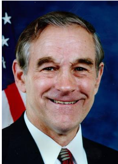
Congressman Ron Paul

The only part of the conduct of anyone, for which he is amenable to society, is that which concerns others. In the part which merely concerns himself, his independence is, of right, absolute. Over himself, over his own body and mind, the individual is sovereign.” [John Stuart Mill]